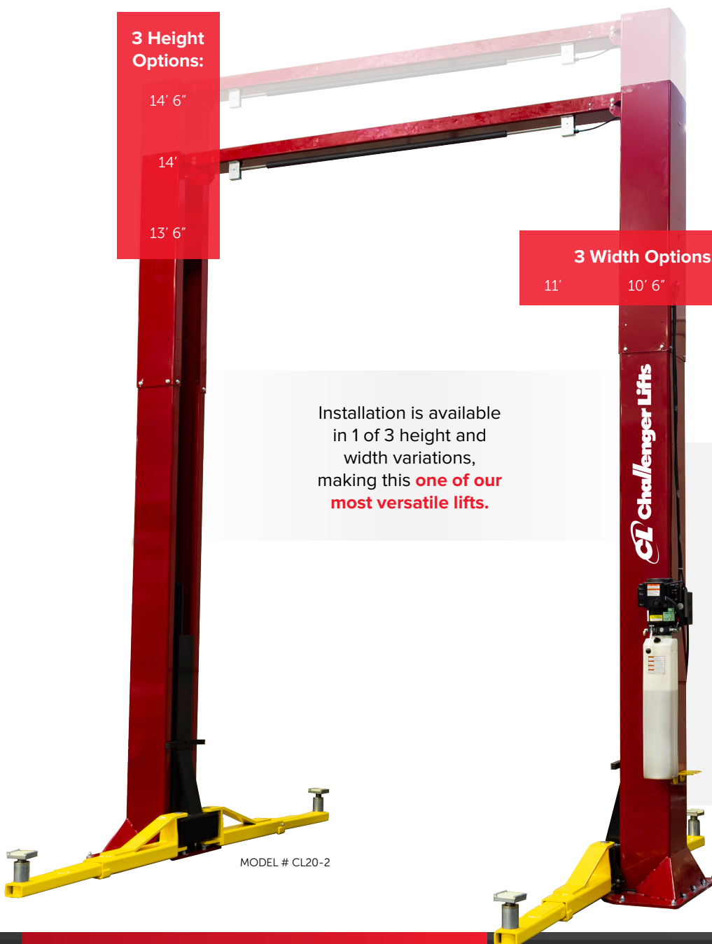
MODEL # CL20-2