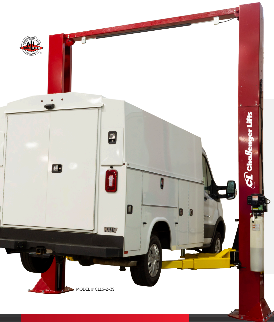
MODEL # CL16-2-3S