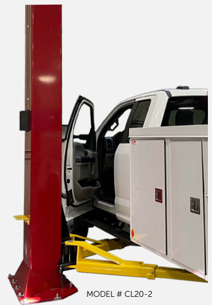
MODEL # CL20-2