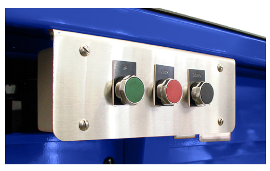
Bench Mount Controls

Standard power control unit mounts to walls near workbenches. Inground lifts feature a single-push button lift function and down-release valve handle. Optional bench mounted power controls include raise, lower and lock release functions. Controls mount to workbenches, providing convenient access to inground lift controls.